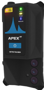
Back View (Raman)